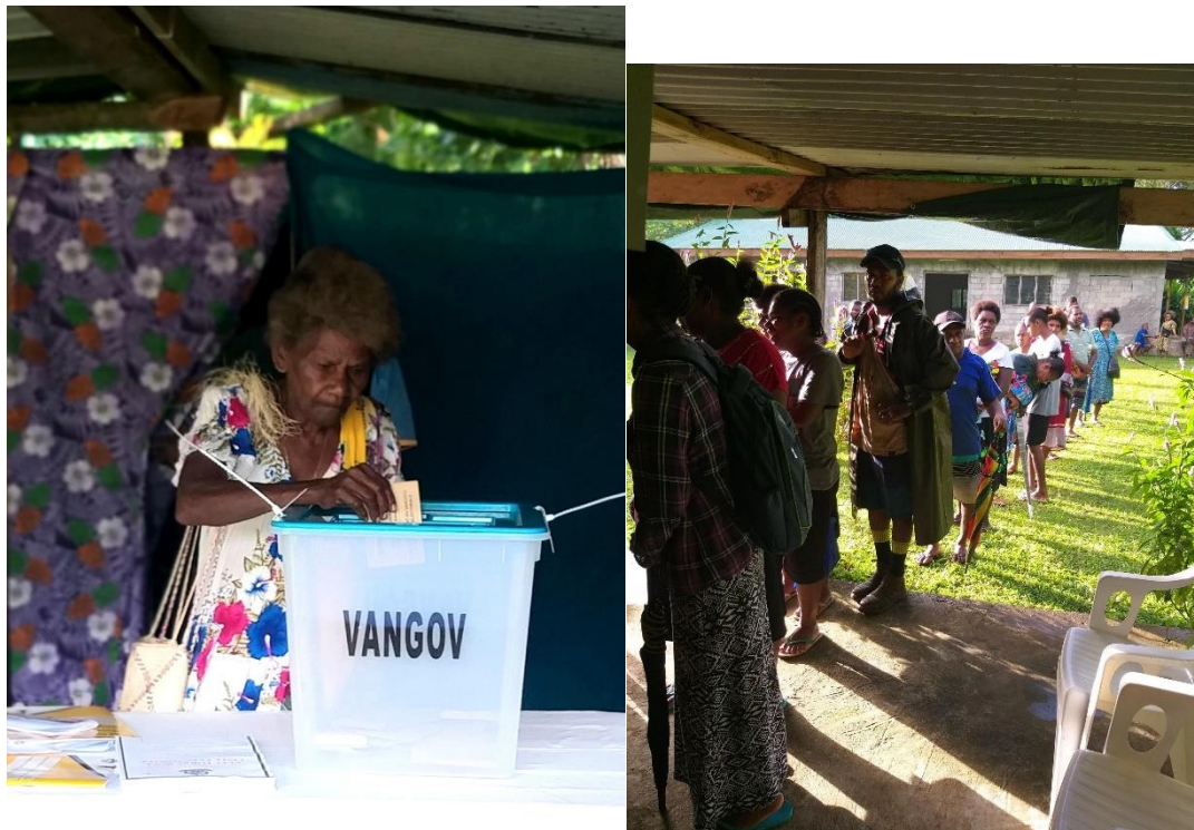
Provincial Elections on 12 May 2021 in Malampa, Penama, Tanna and Shefa provinces

Implementing Partner: United Nations Development Programme